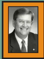
Charles Bronson Georgia