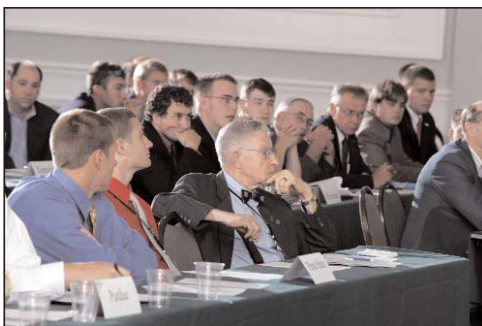
Brothers of the fraternity listen to the business of the closing session of the 58th National Convention.