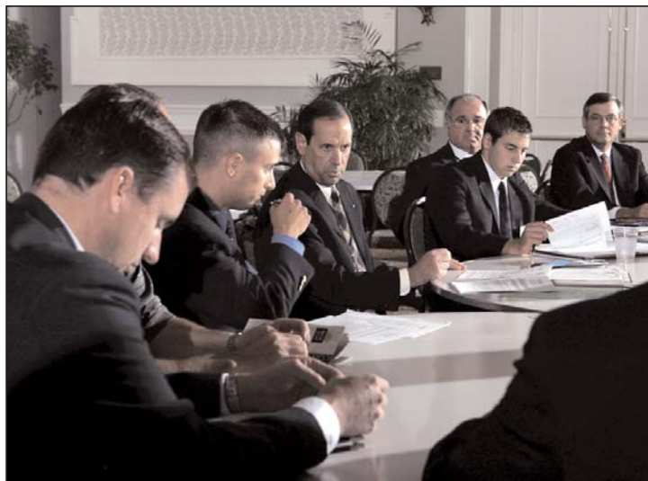
National leaders discuss issues of the fraternity during a meeting at this year's 58th National Convention.